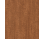
0161 LIGHT AFRO