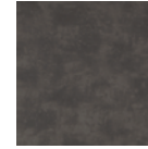
0027 PRADO AGATE GREY