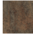
0794 PATINA BRONZE