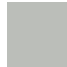
0074 PASTEL GREY