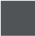
0070 CARBON GREY