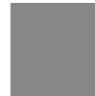
2181 VOLCANO GREY